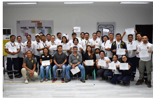
PMC employees pose for a group photo as they finished the Basic ICS Training for Managers and Supervisors on October 21, 2023.

"Ang kaning atong ICS system, dili ra man ni ma-apply sa safety ug emergency lang. I'm sure nga kani nga training ma-apply nato sa atong kaugalingon na mga departments," he said.