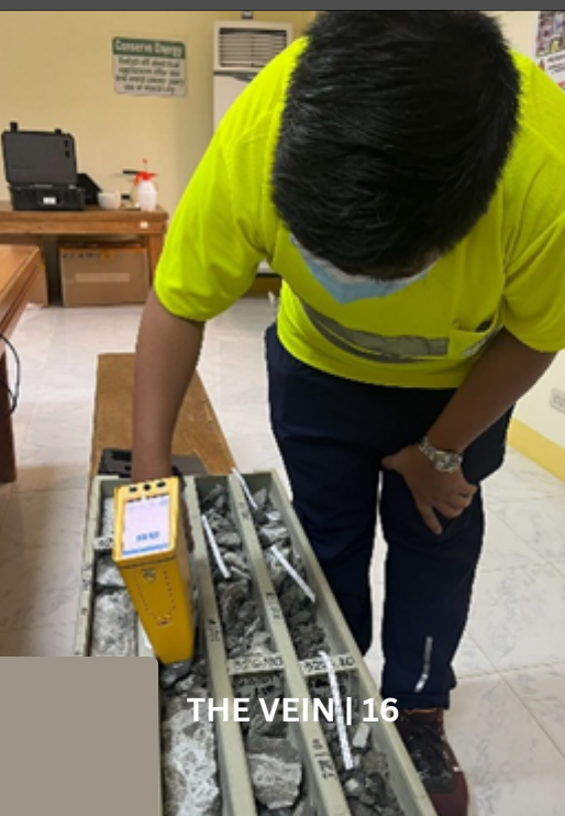
Using the pXRF to analyse drill cores (left), directly on top of pulps (middle), and using the workstation setup (right).

The Exploration Division expresses its gratitude to PMC management for approving the acquisition of the XRF analyzer and for their support in initiatives promoting the cost-efficiency of its work.