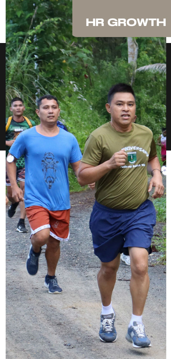
Security personnel of PMC energizes their day with an early morning 3-km run during the PFT Evaluation.

As the program continues to evolve, it is poised to contribute not only to the individual health of SEG members but also to the overall security and efficiency of PMC.