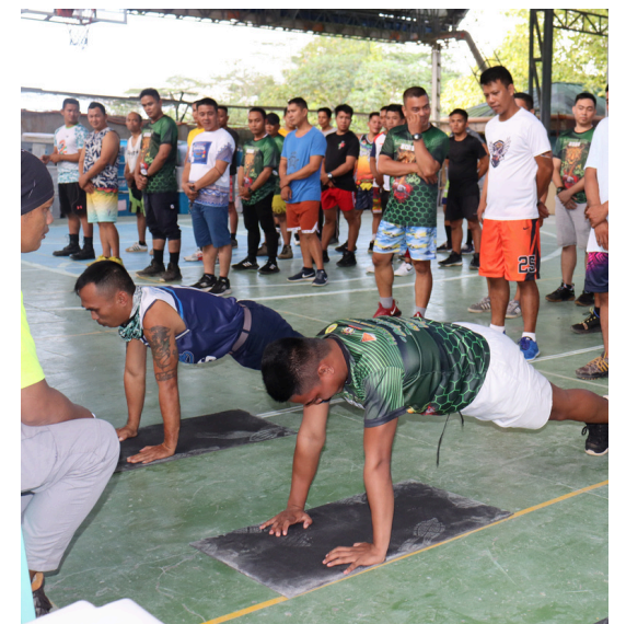
Security personnel of the PMC show off their powerful push-ups as part of the physical fitness program.