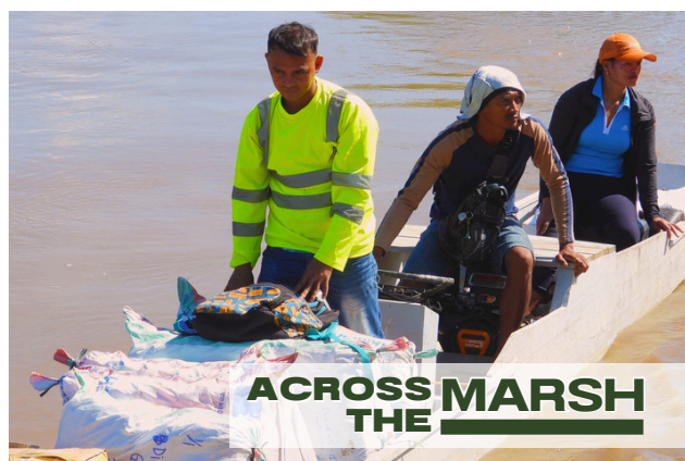
Agusan Marsh: Dinagat and San Marcos ES

Through initiatives like the AASP, the PMC continues to demonstrate its role as a responsible company, contributing to the sustainable development and growth of the areas it serves.