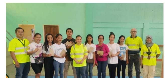
DHNC Student Assistance Program graduates receive their incentive during the DHNC-DMTG Scholars Recognition on August 11, 2023.

Meanwhile, the DMTG Scholarship provides support to indigent and deserving college students pursuing mining-related courses, offering beneficiaries a monthly allowance of PhP 4,000.00, a book allowance of PhP 4,000.00/semester, PhP 500.00 for boarding and lodging, and PhP 1,000.00 for miscellaneous fees.