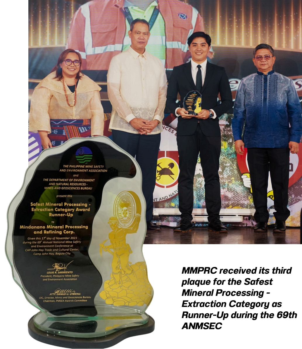
MMPRC received its third plaque for the Safest Mineral Processing - Extraction Category as Runner-Up during the 69th ANMSEC

The awarding ceremony was part of the week-long celebration of the ANMSEC, held annually at Camp John Hay, Baguio City.